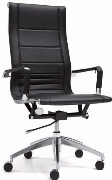
Back/chair seat 椅背 /椅座