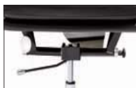
倾仰强度调节/锁定 Tilting tension adjustment and locking