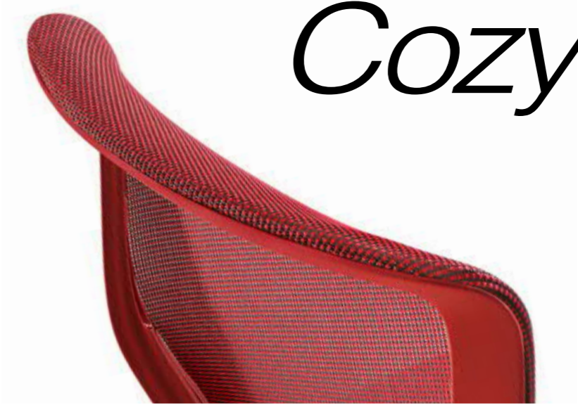
Comfort to the Edge You can completely relax and enjoy laziness from your neck to your hips.